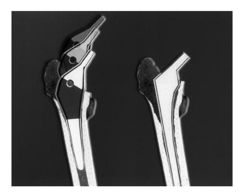
Fig. 4. Concept of 'rest fit'. Left: A lateral flare stem rests on top of the medial and lateral femoral cortices. Right: A straight stem must rely on the medial cortex or the femur to achieve initial stability

Our findings correlate with previous clinical prospective studies [10, 12], which demonstrate more than 95% bone preservation of the proximal femur and less than 1 mm of femoral component subsidence 4 years after surgery, despite the fact that all the patients were permitted immediate full weight bearing on uncemented stems.