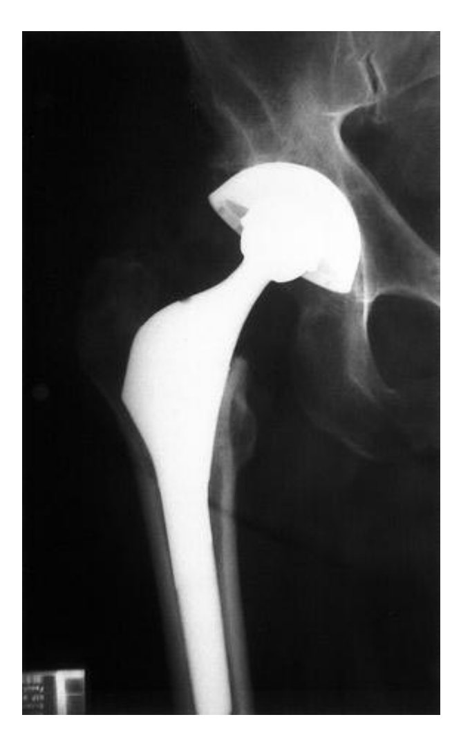
Fig. 1. Typical X-ray of a lateral flare stem. Engagement of the lateral and medial femoral cortices creates a broader base of support for the device